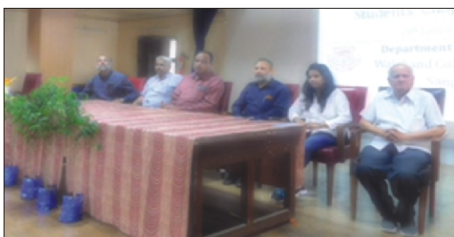
Guests on dais