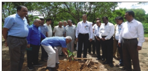
Plantation by present Members