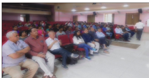
Students and faculty members of Walchand College of Engineering, Sangli