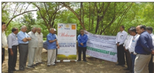
Present faculty members of DOT, Shivaji University, Kolhapur, Corporate Members of IEI, Kolhapur Local Centre and Members of Rotary Club, Kolhapur