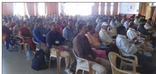
Present Students and faculty members of DOT, Shivaji University, Kolhapur and Corporate Members of IEI, Kolhapur Local Centre.