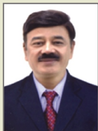
Shri. Avinash Subhedar Collector, Kolhapur