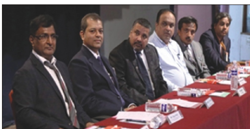
Guests on dais.