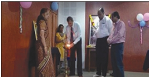
Lighting the Lamps by Guest.