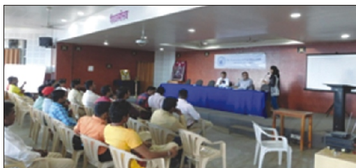
Students of AMIE