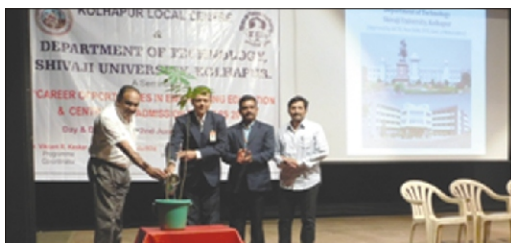
Watering the plant by dignitaries on the dais.