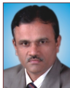
I. P. Secretary