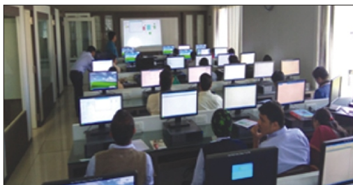
Hands on Experience for the Participates