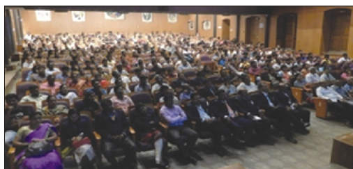
Present Students with their Family and faculty members of DOT, Shivaji University, Kolhapur and Corporate Members of IEI, Kolhapur Local Centre.