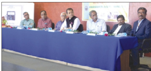
Guests on the dais.