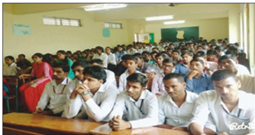
The Students of Dadasaheb Mokashi College of Agricultural Engineering & Food Technology, Rajmachi gathering for programme.