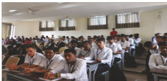
Students and faculty members of Dr. D. Y. Patil College of Agricultural Engineering & Technology, Talasande attending the lecture.