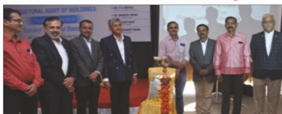
Inauguration of Programme by Guests & Committee Members