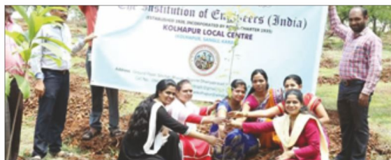
Tree Plantation at Mouje Sangav village, Kolhapur.