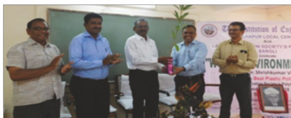
Felicitation of Guest by giving plant