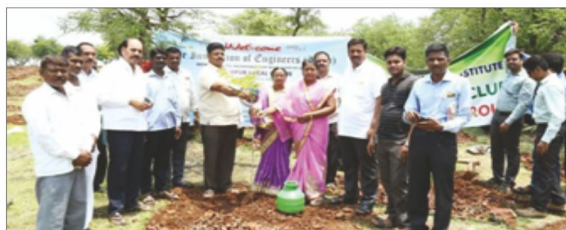
Tree Plantation at Mouje Sangav village, Kolhapur.