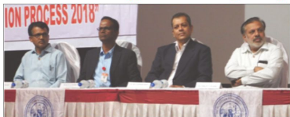
Guests & Committee Members of IEI, Kolhapur Local Centre