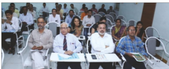
Present participant of this program.